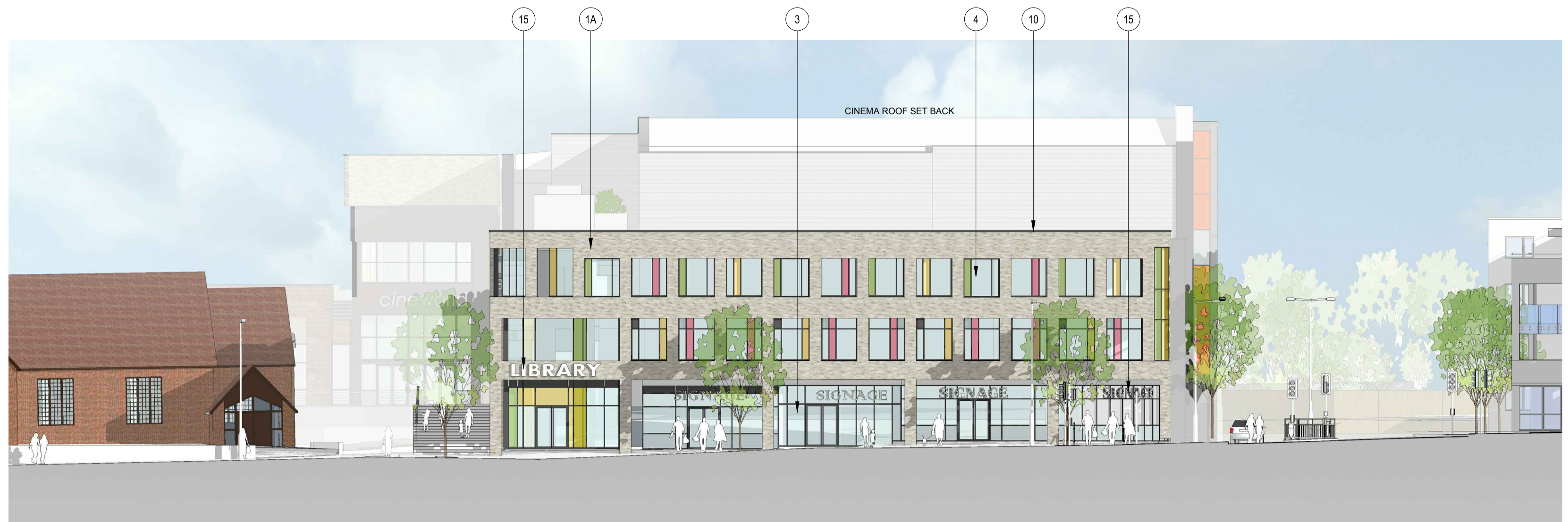
ELEVATION 1 (BLOCK A ELEVATION FACING WEST WAY)