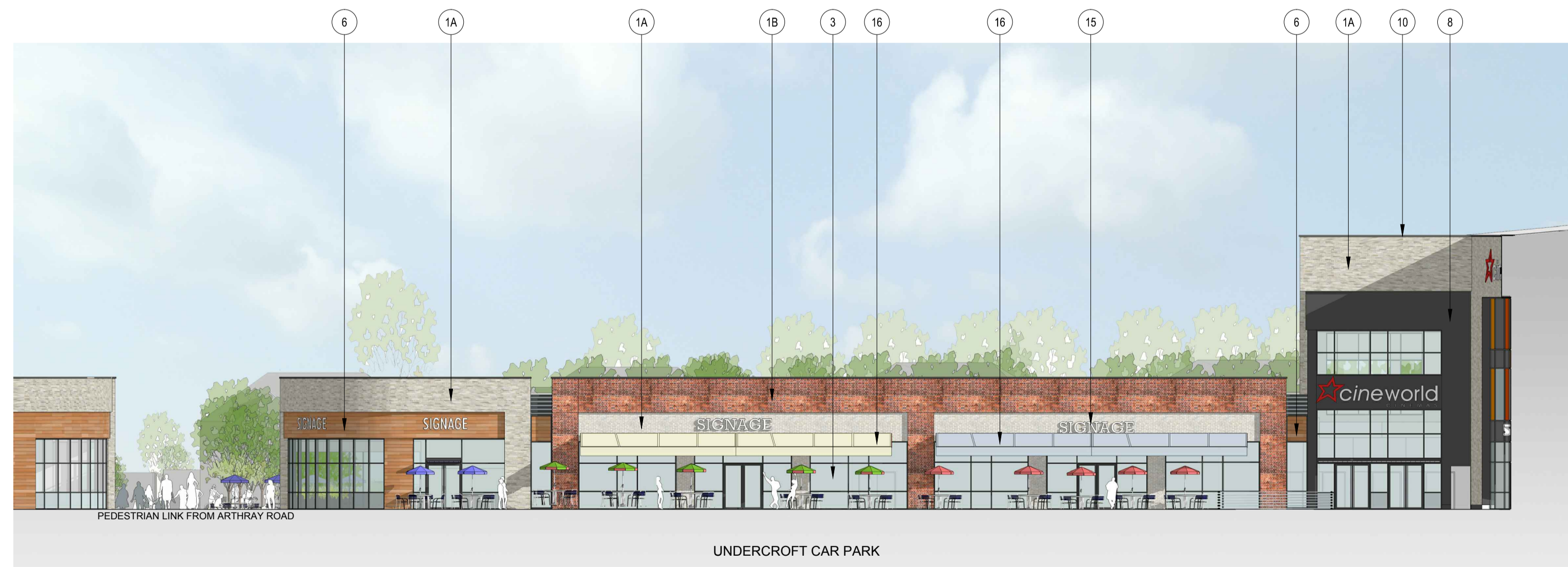
ELEVATION 3 (BLOCK A ELEVATION FACING PIAZZA)

© Mountford Pigott LLP 2012 Reproduction in whole or in part by any means is prohibited without the prior permission of Mountford Pigott LLP. This drawing is only to the stated scale if it is printed correctly. MPLP cannot accept responsibility for the incorrect scaling of drawings printed by third parties. All dimensions are in mm unless otherwise stated. If this drawing forms part of an application for planning permission on behalf of the applicant named below, it shall not be used for any other purpose without the express permission of Mountford Pigott LLP. This drawing may incorporate information from other professionals. Mountford Pigott LLP cannot accept responsibility for the integrity and accuracy of such information. Any clarification and/or additions that are required appertaining to such information should be sought from the relevant profession or their appointment representative as listed below. LIST OF INFORMANTS: Ordnance Survey - Licence number 10001998 REVISIONS SCHEME REVISED DATE 05.08.14 DRN WMS A-DRAFT SCHEME DEVELOPED AND REVISED TO INCORPORATE PLANNERS COMMENTS 02.09.14 WMS A GENERAL UPDATE FOLLOWING PLANNING AUTHORITY COMMENTS 05.11.14 WMS B